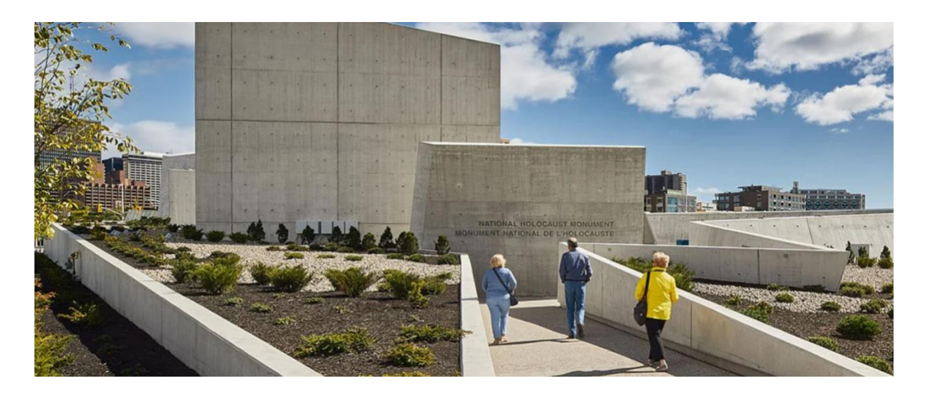
Main Entrance to the National Holocaust Monument

"Without memory, there is no culture. Without memory, there would be no civilization, no society, no future." - Elie Wiesel