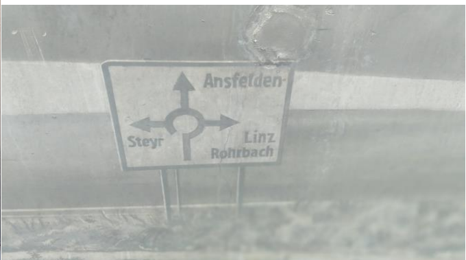
Detail, the road sign